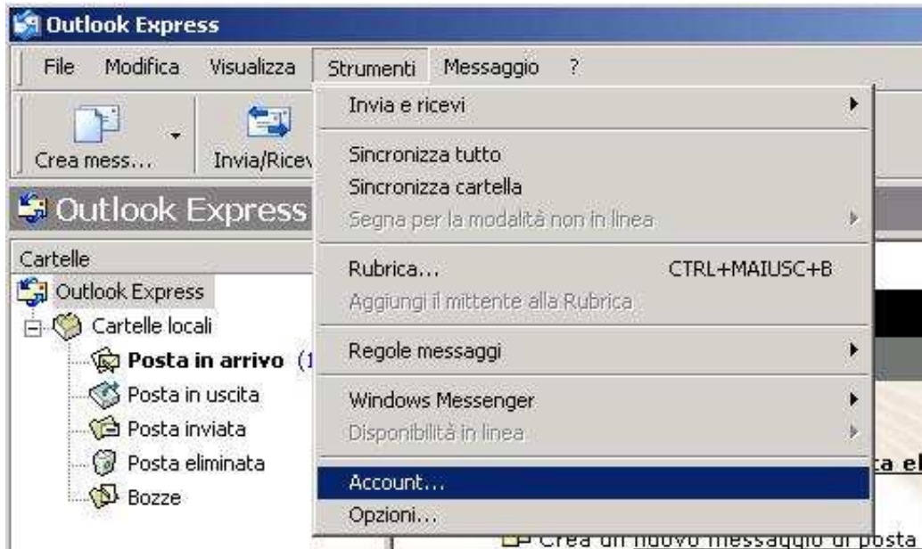
Figure 1: main